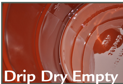
Drip Dry Empty