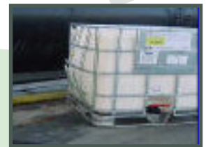
Damaged Cage and/or Pallet