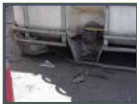
Damaged Corner Piece